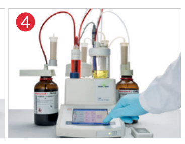
Start the analysis. Start your test with just one click.